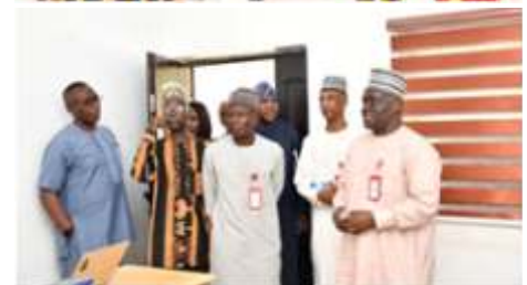
Registrar, TMC, and staff of National Blood Service Commission