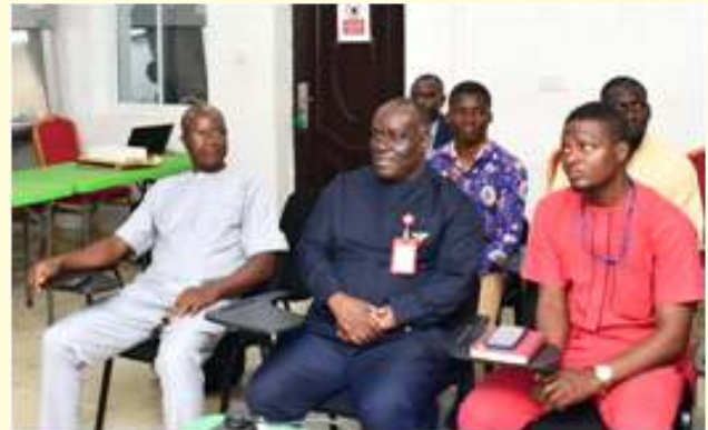
Registrar and the trainees during an interactive session

A tripartite collaboration involving the Medical Laboratory Science Council of Nigeria (MLSCN), the National Sanitation Foundation (NSF) and the Institute of Human Virology Nigeria (IHVN) has resulted in the launch of a comprehensive training program tailored specifically for Biotech Engineers in Nigeria. The five-day intensive training regimen, characterized by hands-on experiential learning, was specifically designed to culminate in the attainment of NSF's Basic Biosafety Cabinet Certification.