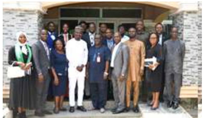
Young Medical Laboratory Scientists, staff and the Registrar