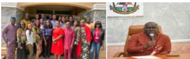
Data protection trainers with select-staff of MLSCN

According to him, the training had become imperative given the digitalization of the Council's processes, which could expose sensitive data to cyber criminals and other unscrupulous elements online. "MLSCN, as a regulatory body, handles and controls various forms of data such as indexing, e-licensing, e-registration of schools and medical laboratories. All of these are personal information shared with us in trust. Therefore, it is our duty to safeguard them in the interest of our clients," he noted.